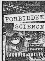
901065 FORBIDDEN SCIENCE Journals 1957-1969. by Jacques Vallee (Science) b/w illus. 473 pp. (1996) pb (Marlowe & Company) ISBN: 1-56924-808-7 List $14.95