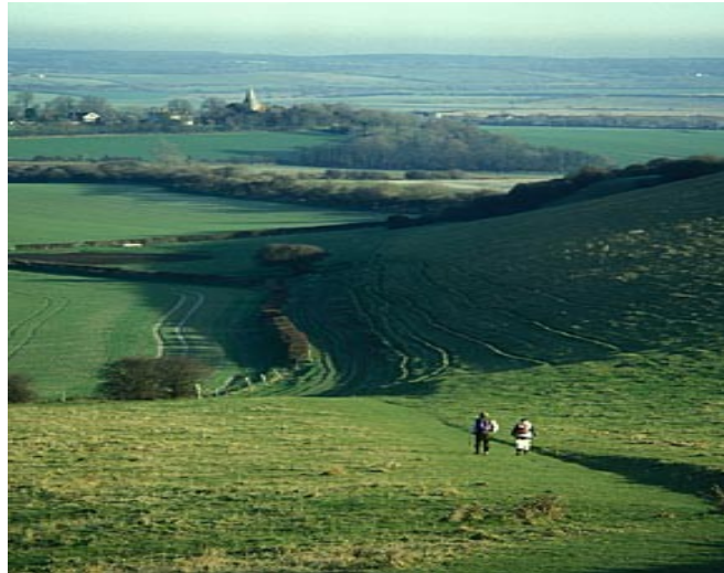
The thicket line as observed from the bay window from the top of Ditchling Beacon.

At 1.45 am the witness looked out of his window across the South Downs near Ditchling Beacon and observed what he thought was a torchlight on the Downs halfway up the hillside. He then realised the light was moving too fast up the hill to be handheld and thought it maybe a light on a bike or a car. When the light reached the top of the Downs, it started travelling west along the top and then began to rise into the sky while still travelling west and also turning to a very bright orange. At this stage he grabbed his binoculars and went outside to see if he could hear any sound, but there was complete silence and the light had become a very intense orange colour. There was no flashing and it was consistent, climbing and travelling west.